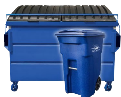
BLUE = RECYCLABLES