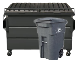
GRAY = GARBAGE