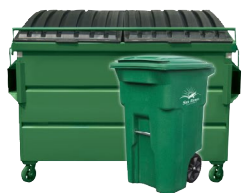
GREEN = ORGANICS