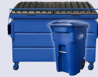
BLUE = RECYCLABLES

Culture of Repair supports local community repair events, advocates for repair at the state and local levels, and promotes repair as a social value. Visit their website for details about upcoming local events, how to volunteer, and more.