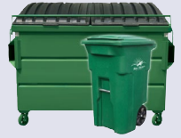
GREEN = ORGANICS