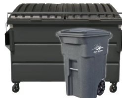
GRAY = GARBAGE