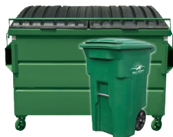
GREEN = ORGANICS