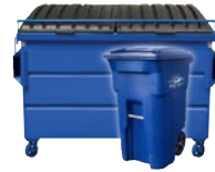
BLUE = RECYCLABLES

Not only is it a state requirement for businesses to recycle wherever possible, but there are discounts available for businesses who sort waste carefully and have the correct levels of recycling and organics service with ACI of San Ramon.