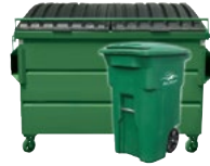
GREEN = ORGANICS

Are you compliant? We can help you improve (or start) your recycling program today! Our sustainability specialists will visit your business to: