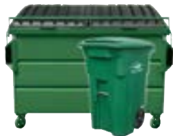
GREEN = ORGANICS