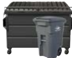
GRAY = GARBAGE