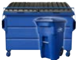
BLUE = RECYCLABLES