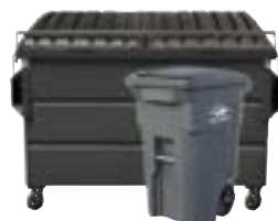
GRAY = GARBAGE