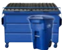
BLUE = RECYCLABLES

Take Advantage of our Collection Programs - Proper use of Recyclables and Organics containers may decrease the amount of Garbage service needed. To change service levels or request additional services, contact ACI of San Ramon at 925-380-9480 or visit our website at www.SanRamonRecycles.com .