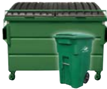
GREEN = ORGANICS

California is requiring organic material (such as food scraps) be diverted away from landfills and surplus food be redirected to hungry people. How can you comply?