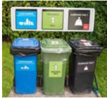
Example of a three stream onsite collection container system.

Businesses that sell products meant for immediate consumption onsite must provide recycling & organics collection bins inside their businesses for their customers.