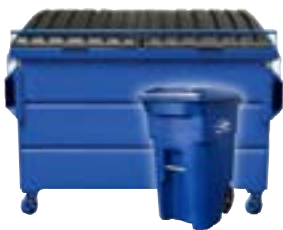
BLUE = RECYCLABLES