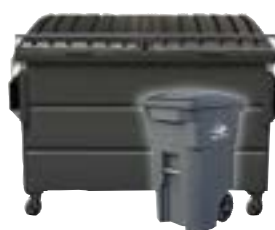
GRAY = GARBAGE