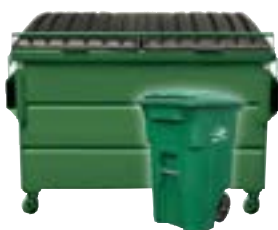
GREEN = ORGANICS