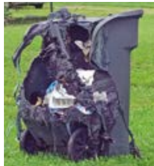
Hot ashes and GARBAGE carts don't mix!

For more information and additional fire safety tips: