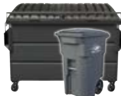
GRAY = GARBAGE