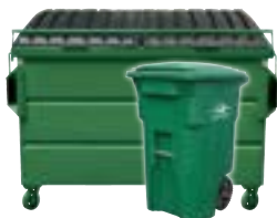
GREEN = ORGANICS