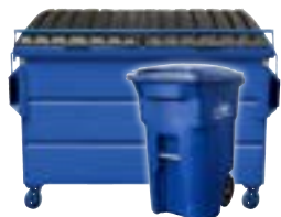
BLUE = RECYCLABLES

Take Advantage of our Collection Programs - Proper use of Recyclables and Organics containers may decrease the amount of Garbage service needed. To change service levels or request additional services, contact ACI of San Ramon at 925-380-9480 or visit our website at www.SanRamonRecycles.com .