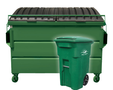
GREEN = ORGANICS