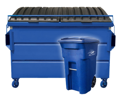
BLUE = RECYCLABLES