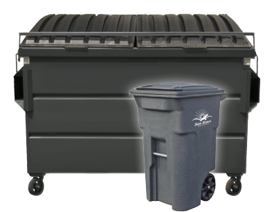
GRAY = GARBAGE